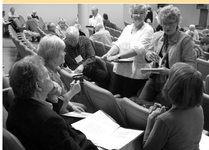
Participants in last Fall's Redefining Retirement workshop get collaborative during the "Finding Your Purpose and Passion" breakout session.